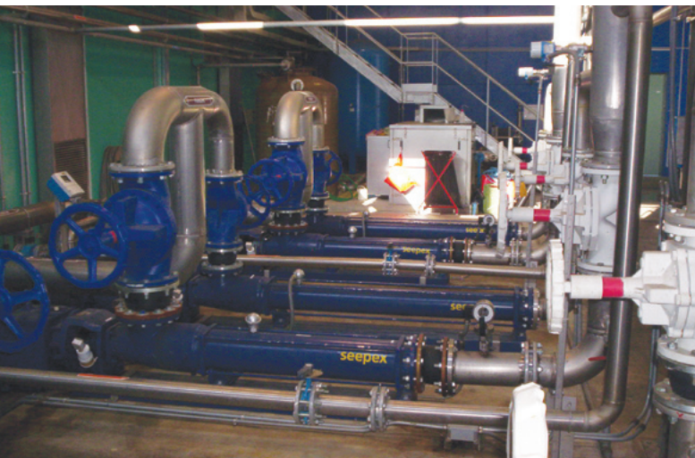
seepex BN range pumps conveying thickened sludge