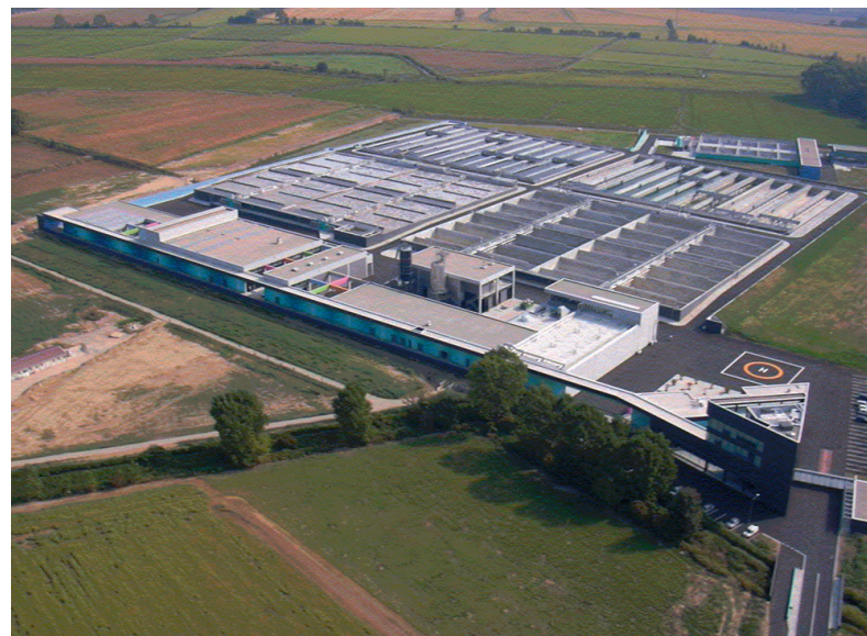
Sewage treatment plant Milano San Rocco

seepex BN range pumps also have to transport biological excess sludge to the thickener, convey thickened sludge to the sludge container, feed wet presses as well as convey and meter flocculants.